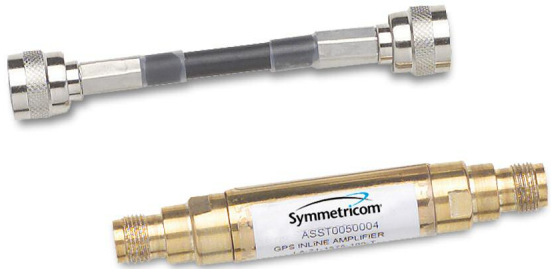
Inline Antenna Amplifier Kit